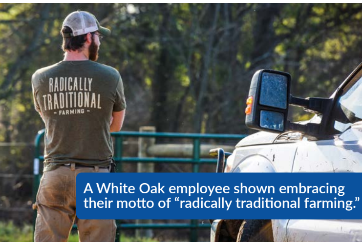
A White Oak employee shown embracing their motto of "radically traditional farming."