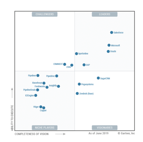
A Leader in Gartner Magic Quadrant for Sales Force Automation, 2019